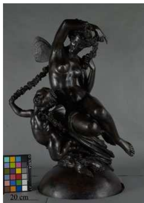
Figure 6 After treatment.

MasonRE S-301: Benzyl alcohol, water, thickening agent methyl cellulose General purpose paint stripper; MasonRE S-303: Light duty paint stripper plus triethanolamine; MasonRE S-305 Heavy duty paint stripper plus hydrogen peroxide, Cathedral Stone Products, Inc. 7266 Park Circle Drive, Hanover MD, 21076, USA. Tel: +01(410)782-915 Fax: +01(410)782-9155 website: www.cathedralstone.com