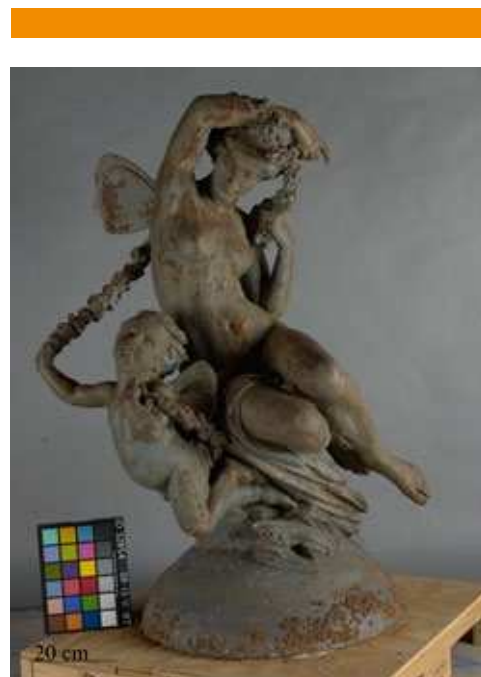
Figure 1 La Fée aux Fleurs , before treatment.