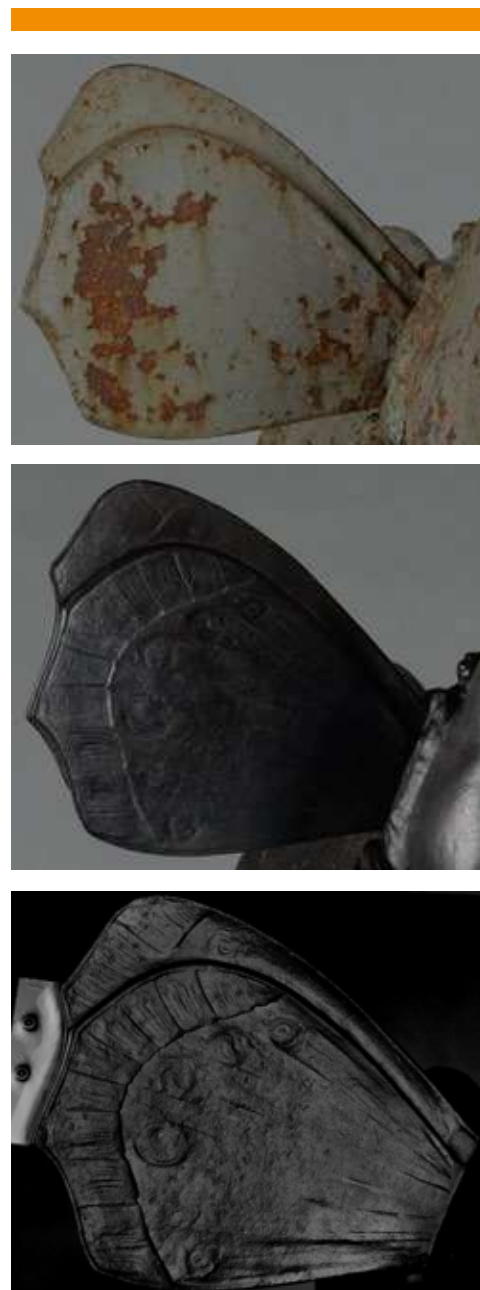
Figure 5 Detail of female figure's proper right wing before (a) and after treatment (b) and RTI (c).

While paint is standard, there has been some research into wax coatings for iron and steel (Conrads, 2008; Hallam et al., 2004; Shashoua et al., 2007; Seipelt et al., 1998). Storch (2006) used a tannic acid-based rust converter, containing an ethylene vinyl acetate resin emulsion followed by a top coat of carnauba wax, on two cast iron bells belonging to the Lac Qui Parle Mission Historic Site in Montevideo, Minnesota. Although not a direct comparison – the bell tower provides a cover – the coating has survived with only one minor maintenance treatment since 2006 (Storch, personal communication, 2013).