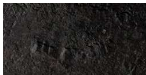
Figure 3 Two of the images of the foundry mark captured during RTI.