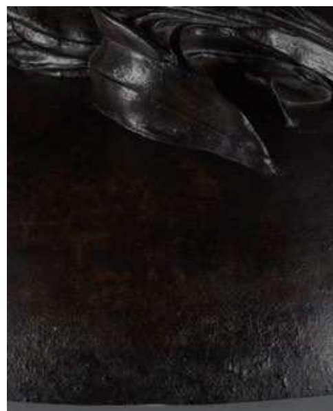
Figure 4 Detail of base before treatment (a) and after treatment (b).